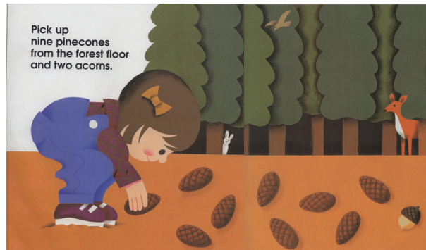
Text copyright © 1993 by Eve Merriam Illustrations copyright © 1993 by Bernie Karlin