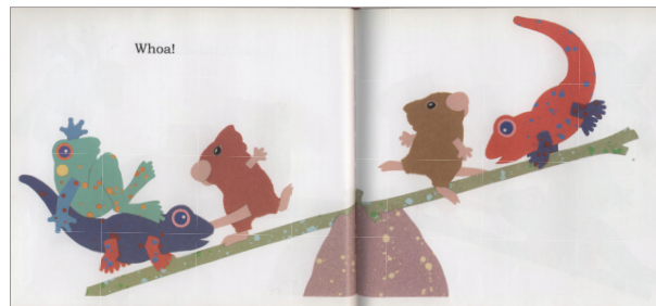
© 2010 by Ellen Stoll Walsh