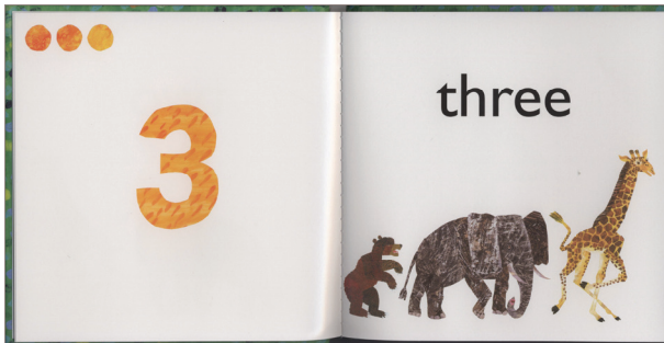
© 1989, 1968 by Eric Carle LLC

Eric Carle's 123 is a counting book. We meet different animals on each page as we count from one to 10. Each page also includes dots that match the number of animals.