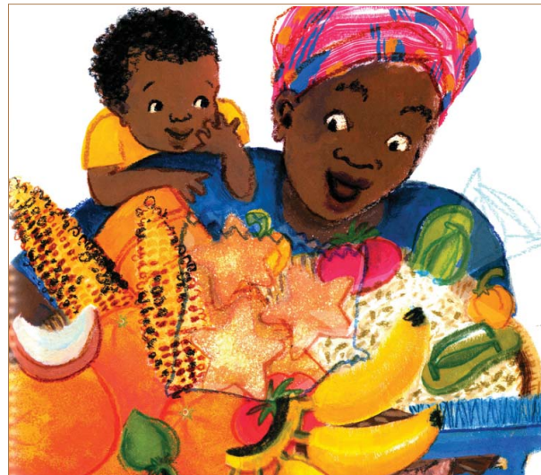
Text © 2017 by Atinuke Illustrations © 2017 by Angela Brooksbank