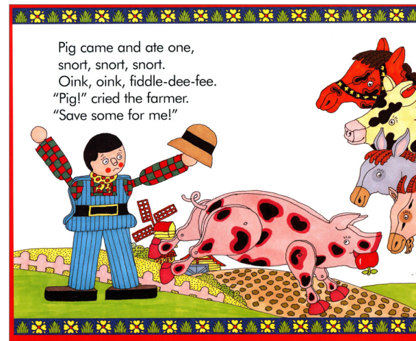
Copyright © 2000 by Pat Hutchins