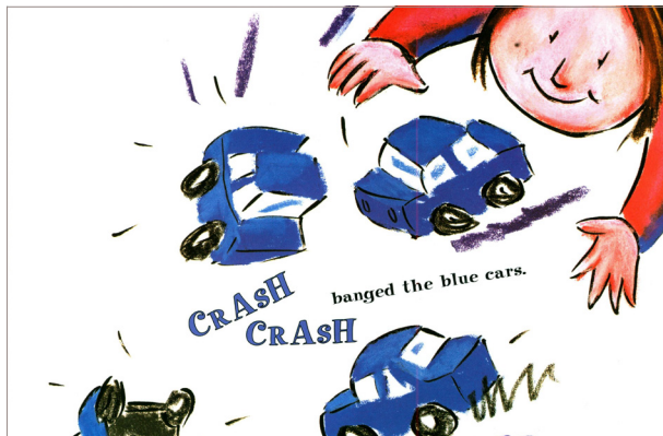
Text copyright © 2000 by Stuart J. Murphy Illustrations copyright © 2000 by Chris Demarest

Kevin doesn't want little sister Molly to play with his toy cars, but when he leaves, she can't resist taking them off the shelf. She has fun making the cars go BEEP BEEP and VROOM VROOM and CRASH CRASH . But Kevin is about to return! Can she put them back on the shelf just as they were before Kevin left? Molly lines them up in the right pattern—red-blue-yellow, red-blue-yellow—and gets a special present of her own!