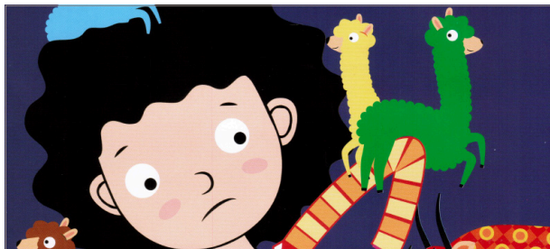
Text copyright © 2017 by Judy Cox. Illustrations copyright © 2017 by Nina Cuneo.

Clarissa couldn't fall asleep, so she counted sheep, one by one. Still no sleep and she ended up with 10 naughty sheep in her room. What about counting pairs of alpacas, 2, 4, 6... to 20? That didn't work either; 20 alpacas crowded in, too. She counted groups of 5 llamas up to 20, and groups of 10 yaks up to 50. Again, no sleep and now 100 stinky animals were messing up her room. How can Clarissa get rid of all these animals so she can sleep?